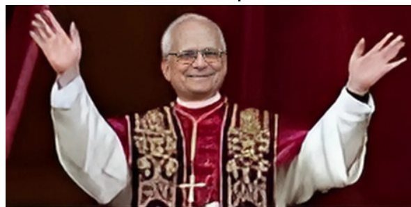
Peter's Pence Collection