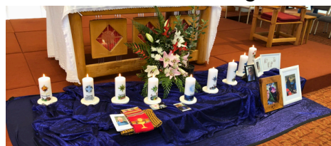
Miha in the Church