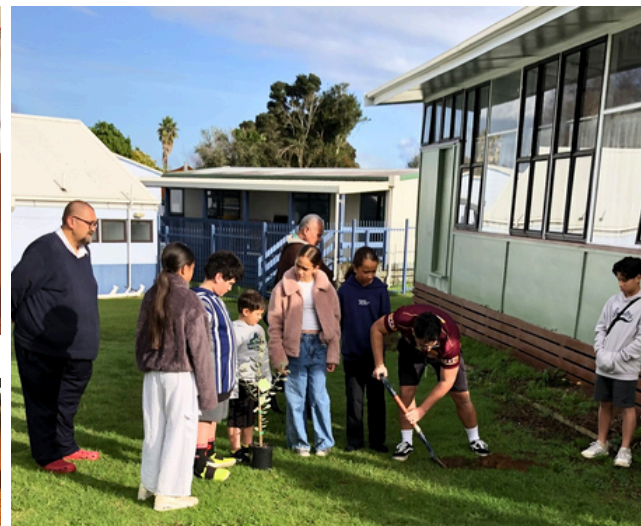
Planting of the tree by the tamariki alongside the wharenuī "NGA KAWAI MAHA"