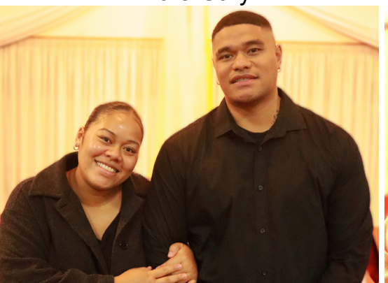
Mallia & Texas