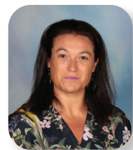
Te aroha o te Atua